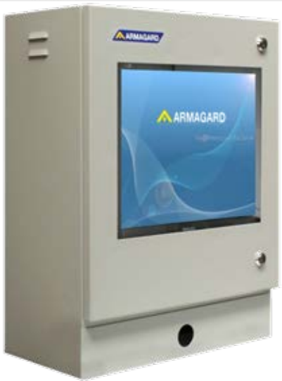
*For Compact Sized Computers

Designed for dirty industrial environments, the Armagard PENC-300 series is a sealed IP54/IP56 pc enclosure, protecting your hardware from damaging airborne particles and impacts.