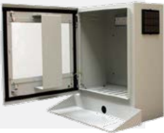
(Specification Varies – Tray not Standard)